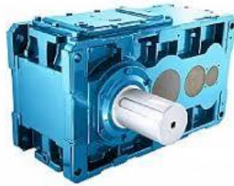
Helical Bevel Helical Gearboxes