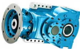
Shaft Mounted Gearboxes