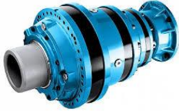
High Torque Planetary Gearboxes