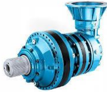
Industrial Planetary Gearboxes