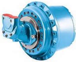
Mobile Planetary Drives