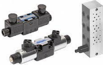
Cetop Valves and Blocks