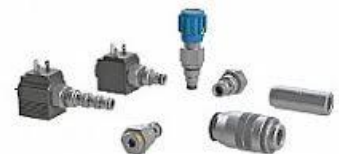
Valves and Logic Elements